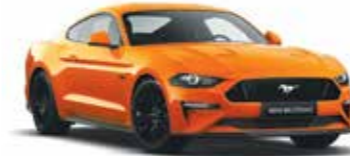
Twister Orange (Metallic)