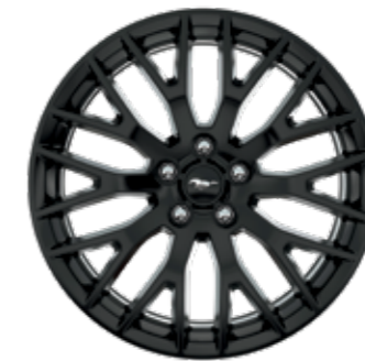
19"x9" (F) 19"x9.5" (R) Ebony Black-painted Aluminium (Standard on 5.0L V8)