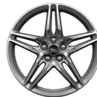
19"x9" Luster Nickel-painted Forged Aluminium (Optional wheel)