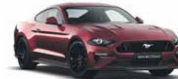
Lucid Red (Metallic)

Colours are representative only. See your Dealer for actual paint/trim options and for more clarification.