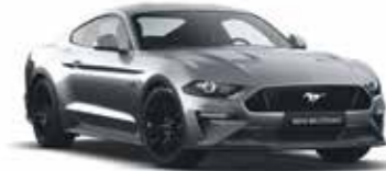
Iconic Silver (Metallic)