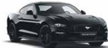
Absolute Black (Metallic)