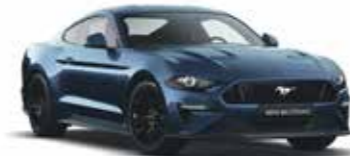
Velocity Blue (Metallic)